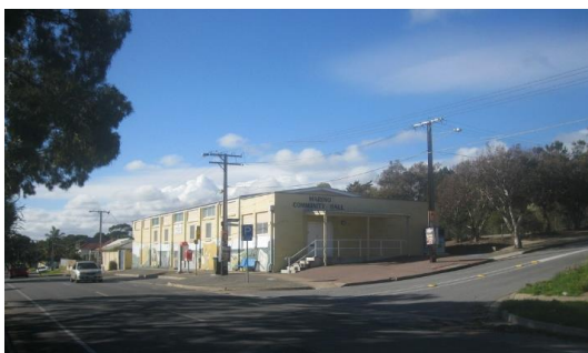
Figure One: The current exterior and interior of the Marino Community Hall.