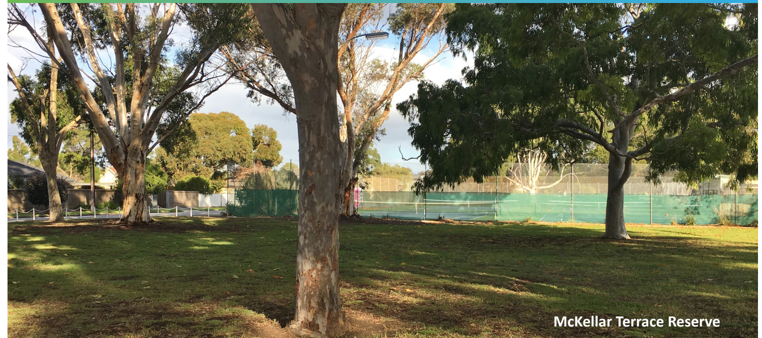
McKellar Terrace Reserve