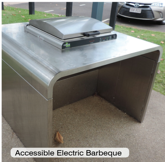
Accessible Electric Barbeque