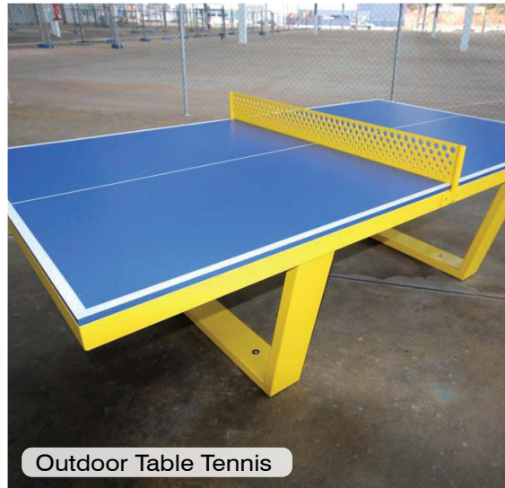
Outdoor Table Tennis