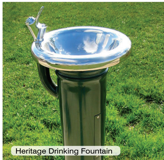
Heritage Drinking Fountain

These images are for illustrative purposes and may slightly differ from the elements included in the final design