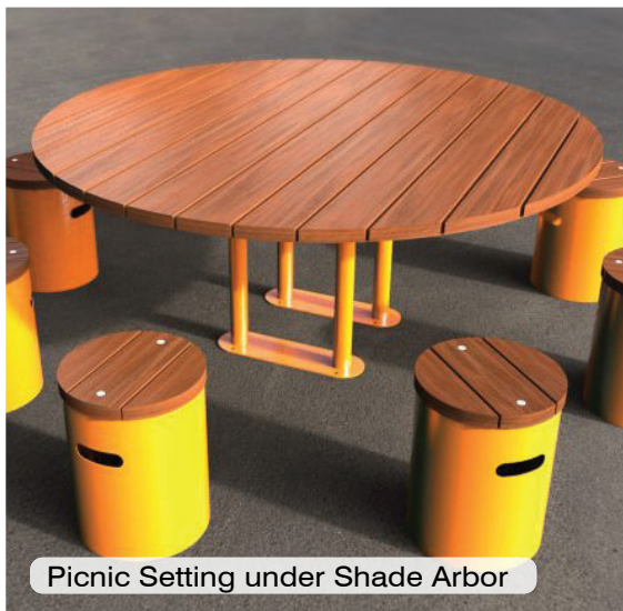
Picnic Setting under Shade Arbor