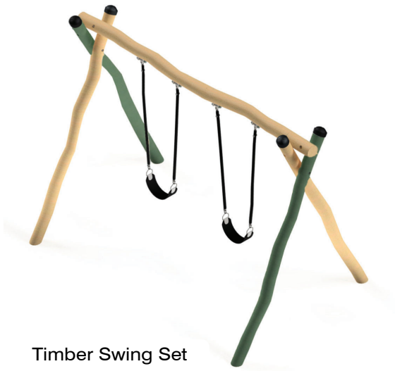
Timber Swing Set