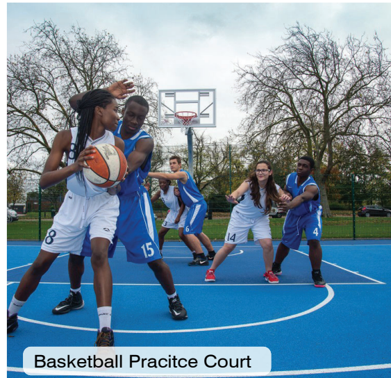
Basketball Practice Court