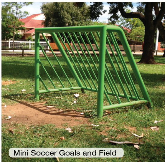
Mini Soccer Goals and Field