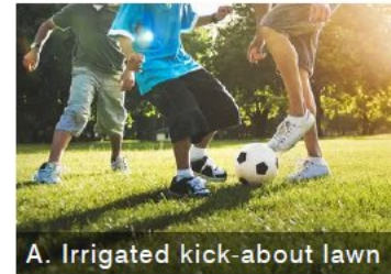
A. Irrigated kick-about lawn

Roy Lander Reserve will be undergoing an upgrade in 2024/2025 as part of the City of Marion Open Space Plan. The upgrade will include active recreation and a new irrigation system to a portion of the reserve.