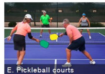
E. Pickleball courts