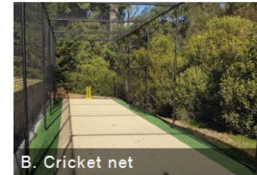
B. Cricket net