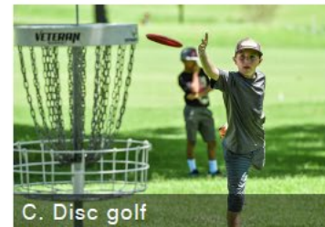
C. Disc golf