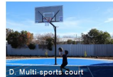
D. Multi-sports court