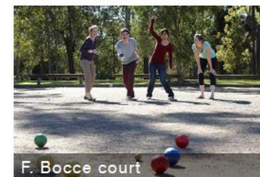
F. Bocce court